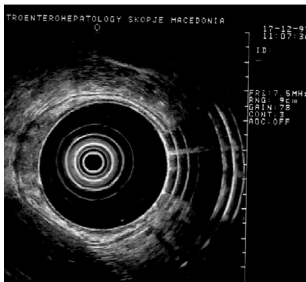
Figure 2 – Endosonographic operable gastric cancer Слика 2 – Ендосонографски ојерабилен желудочен карцином

The second group of 64 pts (32.5%) included those with gastric cancer. According to the endosonographic findings this group consisted of 2 subgroups: 45 operable patients (Fig. 2) and 19 inoperable patients with gastric cancers. (Fig. 3)